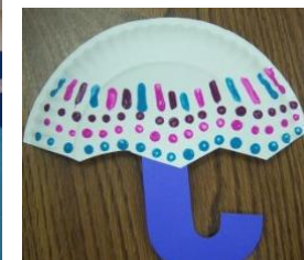
Examples of Patterns